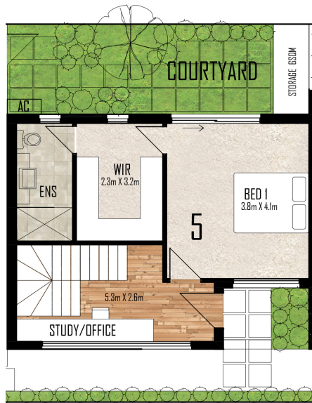
GROUND FLOOR PLAN SCALE: 1:100