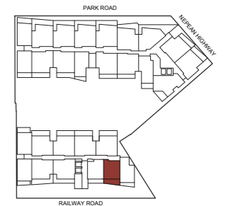
3rd to 5th Level