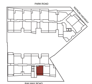
3rd to 5th Level